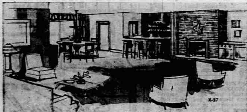
MODERN LUXURY: Here's view from the entrance foyer across the living room into the dining room. Door in dining room wall leads to kitchen. Also visible is pass-through from kitchen to refreshment bar. The hi-fi set can send music to any point in house over intercom system.