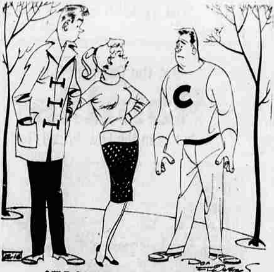
"Can't you get it through your head, Biff? The football season is OVER!"