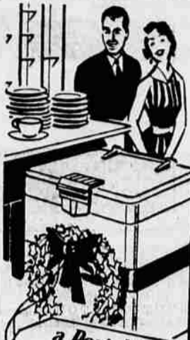
a Portable Dishwasher Merry Christmas from Dad and KitchenAid

Now even the rented home or apartment kitchen can have automatic dishwashing by KitchenAid, with no installation expense. Ideal for a Christmas gift, the KitchenAid portable offers all year freedom from dishwashing drudgery.