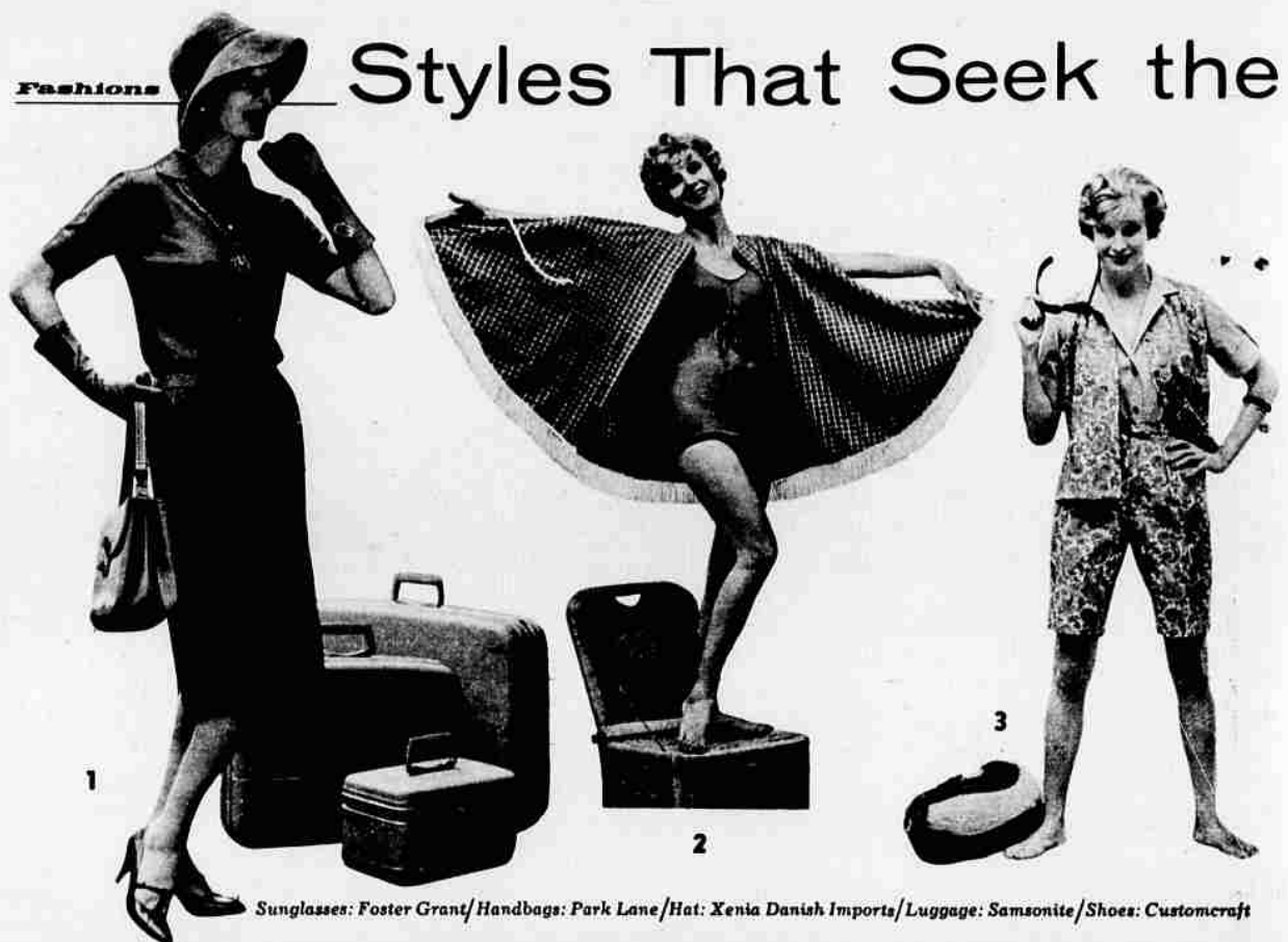
Sunglasses: Foster Grant/Handbags: Park Lane/Hat: Xenia Danish Imports/Luggage: Samsonite/Shoes: Customcraft

RESORT TIME is here again—time to escape from the blustery winds into the enveloping warmth of sunshine. Get more travel mileage and pleasure by using lightweight luggage filled with versatile, packable clothing—packable even to a smartly casual floppy hat. The simple designs of travel-wise knits and easy-to-pack textured fabrics are still a best bet. In addition, this year we multiply to conquer space. Multipart ensembles, re-mated, produce numberless combinations. A few outfits thus enable you to travel light and avoid the burden of excess baggage.