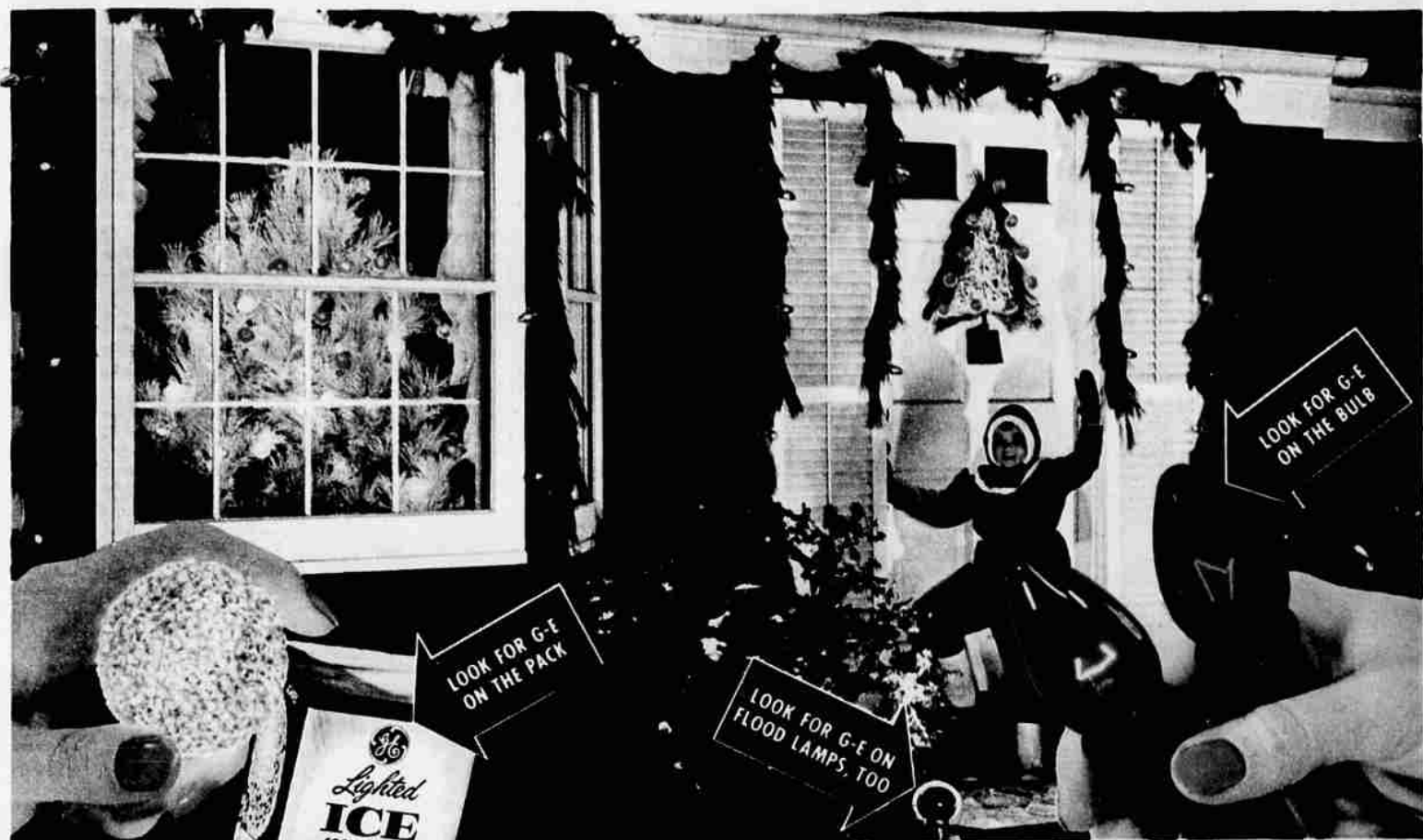
New G-E LIGHTED ICE D30