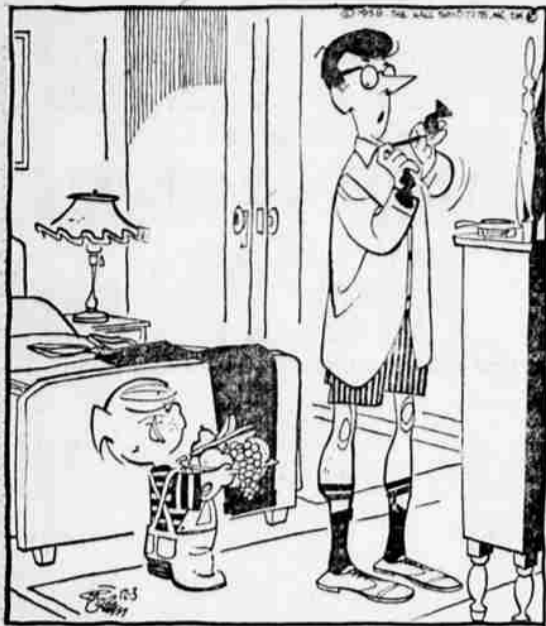
"DENNIS, STOP WORRYING ABOUT ME! I'M NATURALLY THIN! AND I'LL NEVER BE HUSKY LIKE COWBOY BOB!"