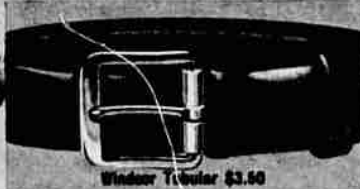
Window Tintular $3.50