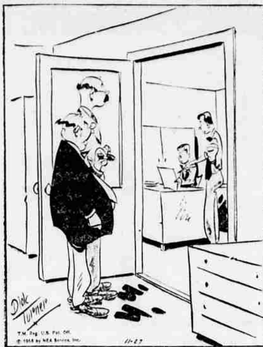
"You've got to admit he's a hustler, J.G.! He's only been here for four days and already he's got a basketball and a hockey pool started!"