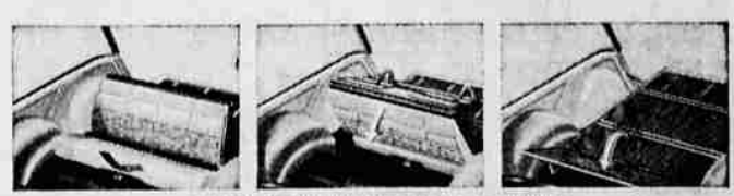
ONLY SELF-STORING THIRD SEAT THAT FACES FORWARD Passenger space becomes cargo space in seconds in the Country Cruisers. Now the 3rd seat, as well as the 2nd seat, is self-storing. No need to remove seat cushions and haul to garage; the 3rd seat folds down, slides away into a recess in the floor.

In addition to the new ideas shown at the right, Mercury offers you the most usable cargo space in any station wagon. More comfort, too. More space between seats...9 inches more leg room up front, 6 inches more entrance room, too. The new Marauder V-8 engines are as economical as they are brilliant. The quiet smoothness of the ride is matched only by the costliest passenger cars. And there is so much more. See these luxurious Country Cruisers in person at our showroom.