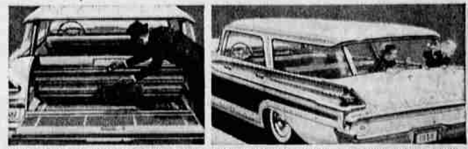
NEW! CONCEALED PACKAGE COMPARTMENT Now... for your valuables, a secret storage space with lid and lock. Conveniently located just in front of the tailgate—a hidden floor "safe." UNIQUE HARDTOP STYLING...RETRACTABLE REAR WINDOW No view-blocking pillars with Mercury's hardtop styling. One pillar replaces three found in most wagons. The rear window slides down into tailgate. This eliminates the need for the heavy liftgate.

20th ANNIVERSARY '59 MERCURY BUILT TO LEAD...BUILT TO LAST