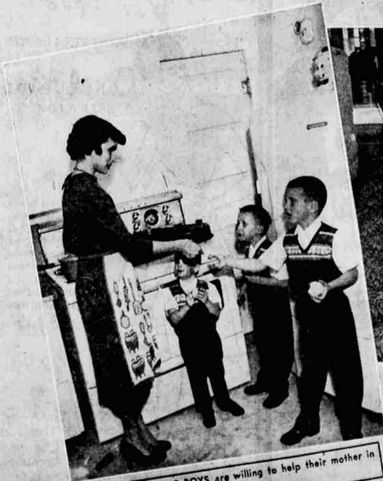
THREE LITTLE BOYS are willing to help their mother in the last minute preparations.