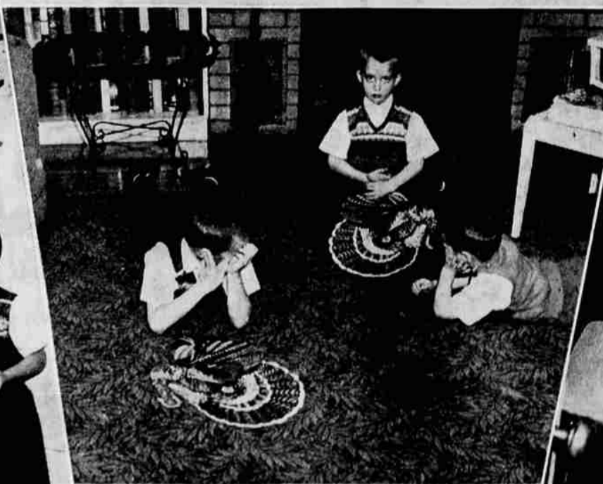
DO WE HAVE TO DECORATE with them, Daddy, can't we use the turkeys to play with?