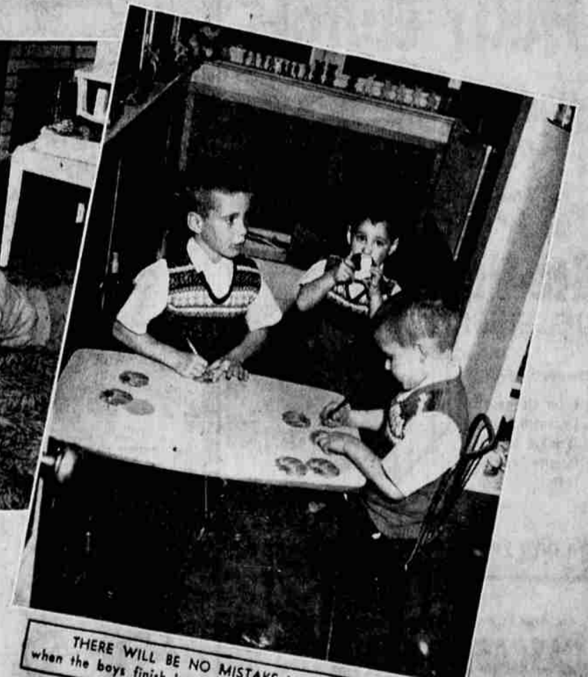
THERE WILL BE NO MISTAKE in places at the table when the boys finish lettering pumpkin place cards.