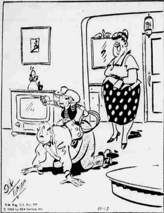
"You playing his games is good training, dear! It teaches him to get along with OTHER children!"