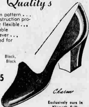
Charm Exclusively ours in Klamath Falls