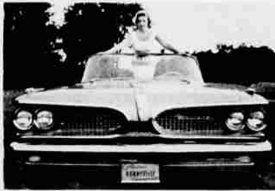
Pontiac is nine inches longer, three inches broader than its 1958 models.

in the car-wide grill. Oldsmobile spaces the four lenses almost evenly across the front with beautiful effectiveness, while Buick and Lincoln prefer angled treatment.