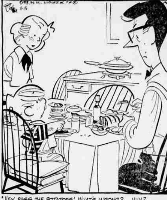
"HEY, PASS THE POTATOES! WHAT'S WRONG?... HUH?... OH! HEY, PLEASE PASS THE POTATOES!"