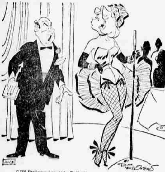
"You can't ignore these requests—so sing 'The Old Oaken Bucket!'"