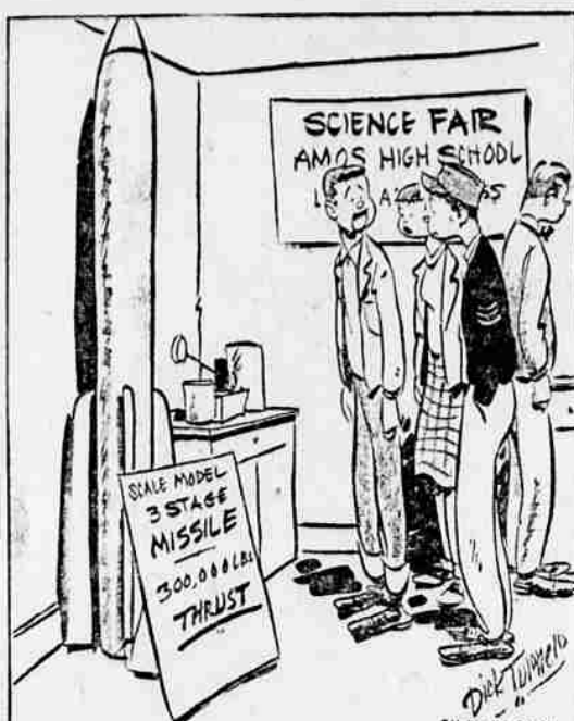
"Speaking of thrust, you should meet Helen's father!"

A buyer for your business may be watching "Business Opportunities" in Classified today. TU 4-8111 to advertise your place.