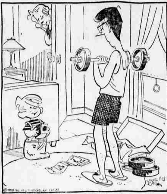
"WE'LL CALL THIS ONE 'BEFORE.'"