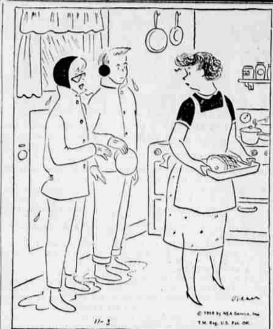
"Can we borrow the shower curtain? There's no top on Harvey's convertible!"