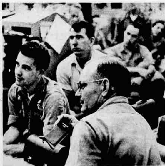
Their lunch finished, airline Bible group listens attentively to discussion of text.