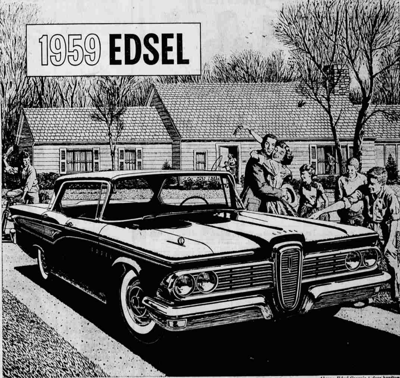
Above: Edsel Corsair 4-door hardtop

Schenley Distillers Co., N.Y.C. • Blended Whisky of Elegance • 85 Proof, 65% Grain Neutral Spirits