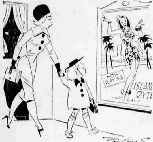
"Because she didn't NEED a hula hoop. That's why, dear."