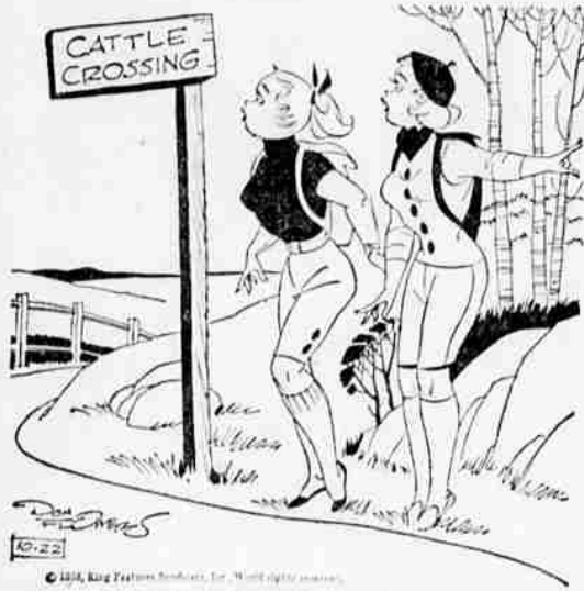
"Let's go down the road a piece."