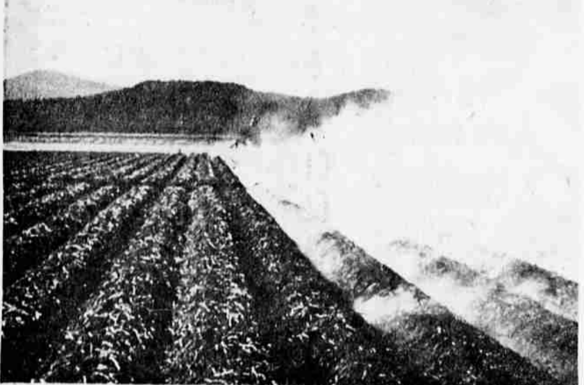
ANOTHER VIEW of the new burner in operation is shown here, as it takes a four-row swath down a potato field. Burners may prove more efficient than beaters for vine removal with the added advantage of some degree of control over verticillium wilt.