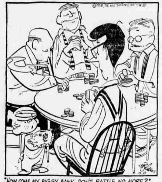
"HOW COME MY PIGGY BANK DON'T RATTLE NO MORE?"