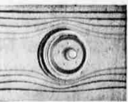
Air-Cooled True-Contour Brakes

Plus plenty of leg and head room. Pontiac's living-room comfort lets you change position naturally... choose the way you like to sit—not the way you have to! Pontiac seats offer still other new comfort advantages over the average sofa. They're wider, have higher backs and slant downward at the rear for maximum support under the knees for safer, more comfortable driving.