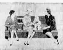
Seats Wider than a Sofa

If you want the accent on economy, choose Pontiac's revolutionary new Tempest 420E. This new V-8 actually delivers better mileage than many smaller cars with so-called economy engines... and it uses regular octane fuel for further savings!