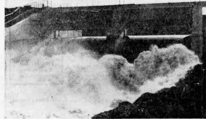
OFFICIALS INSPECTION TOUR was set today for California Oregon Power Company officials who were visiting the Big Bend project on the Klamath River. Shown here is the concrete dam spillway during high water. The dam is located on the Klamath River about a mile downstream from the highway bridge on Oregon State Highway 31. Overall crest length is 652 feet, height 72 feet and width at crest is 18 feet.