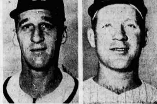
WARREN SPAHN WHITEY FORD Southpaws vie in opener

Yankees second Berra drove Spahn's first pitch to left center field for a single. Skowron singled to left, but Berra was out trying for third, Covington to Mathews, Skowron going to second on the play. Carey fled to Pakko, Skowron holding second. Kubek was called out on strikes. No runs, two hits, no errors, one left.