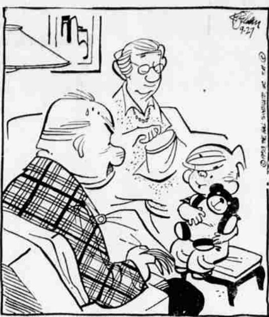
"DID YA KNOW IT WAS ME TALKIN'?" HUH? DID YA SEE MY LIPS MOVE? HUH? ..."