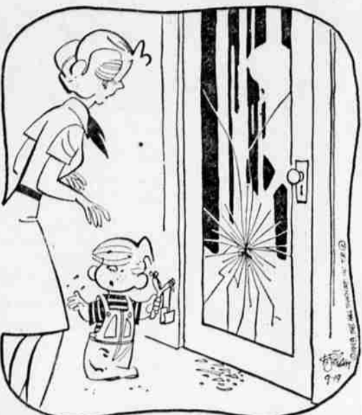
"I WAS PRETENDING THE GUY IN THE MIRROR WAS GONNA LET ME HAVE IT... AN' I GUESS I GOT MIXED UP!"