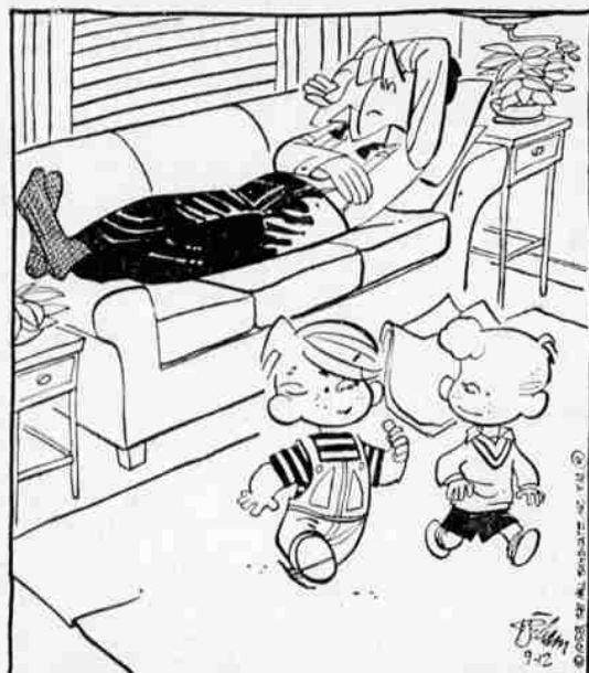
"IMAGINE SOMEBODY WANTIN' TO TAKE AN AFTERNOON NAP?"