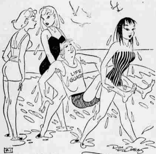
"He couldn't make up his mind which one of us to rescue first."