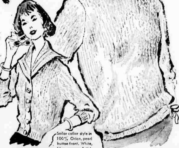
Sailor collar style in 100% Orlon, pearl button front. White, blue, orange. S-M-L.