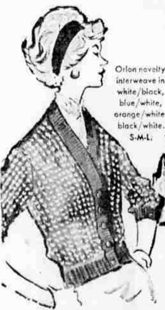
Orlon novelty interweave in white/black, blue/white, orange/white, black/white. S-M-L.