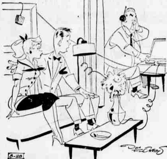
© 1958, King Features Syndicate, Inc. World rights reserved. "Maybe we'd better go out some place after all."