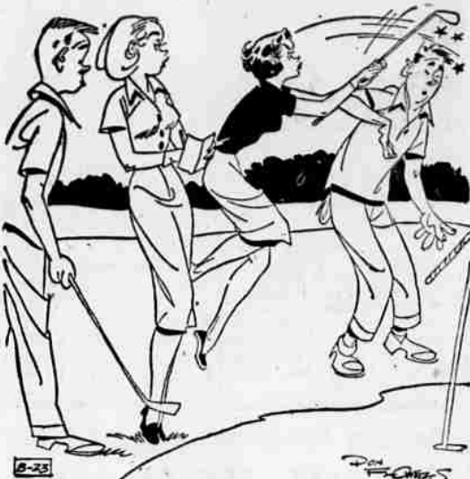
"Do we charge her for those strokes?"