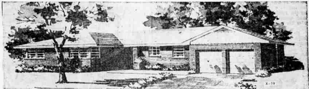
ALL EXTERIOR WALLS of this ranch are of brick veneer. Vertical boards are used on the front gable over the two-car garage. Three bedrooms and two baths are in the wing at the left of the entrance.

The wainscot paneled wall section in the living room has built-in book cabinets five feet above floor level. The floor-to-ceiling sep-