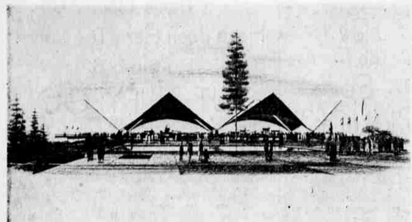
ONE OF WORLD'S most unusual and progressive structures will rise at Oregon Centennial Exposition and International Trade Fair next year as forest products industries pavilion. Total cost of the pavilion and exhibits will be $250,000. Building, shown here, will cover 24,000 square feet, will remain as permanent building for 4-H groups following close of exposition. It will be constructed completely of wooden 2 x 4's.

TAIL RIDERS CHICAGO (UPD) — Eight per cent of all drivers involved in traffic accidents were following the car ahead too closely, according to the Chicago Motor Club. World's Only Fully Automatic Cleaner ELECTROLUX Factory-Authorized Sales and Service TARKEL TWEET Ph. 4-7167 2550 White St.