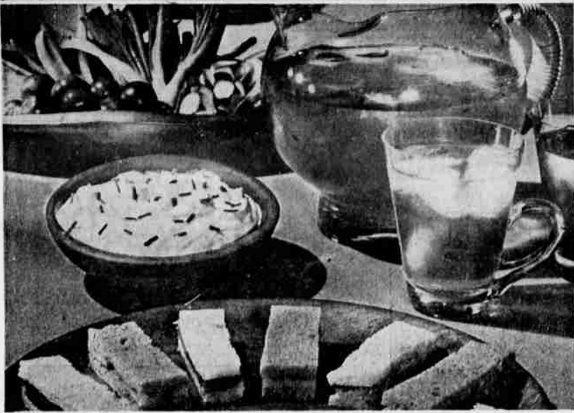
LOVE MATCH —Soup on the Rocks and Sandwiches. August is National Sandwich Month and Soup on the Rocks is a favorite at any time. For a quick pick-up, the amber beverage is singularly appropriate to offset the effects of fatigue, heat and humidity. Just open a can of condensed beef broth (bouillon). Break out the ice cubes and pour. Stir well until chilled. And remember this: Don't use consommé. It jellies when poured over ice.