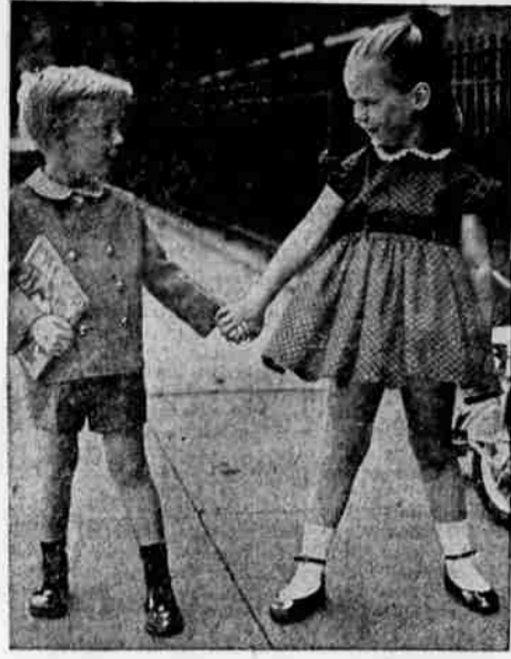
READIN', WRITIN' AND FASHION FIGURIN' — For the lollipop set here are two outfits in Acrilan-and-wool easy-care fabrics. His is a two-piece suit with printed challis shirt. Hers, is a matching challis print dress with a velveteen.