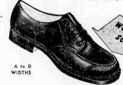
A to D WIDTHS

Of course your boy romps, jumps, and kicks . . . which makes new shoes look worn. Let us fit him now in Poll-Parrot shoes with wear-resisting scuff-tips!