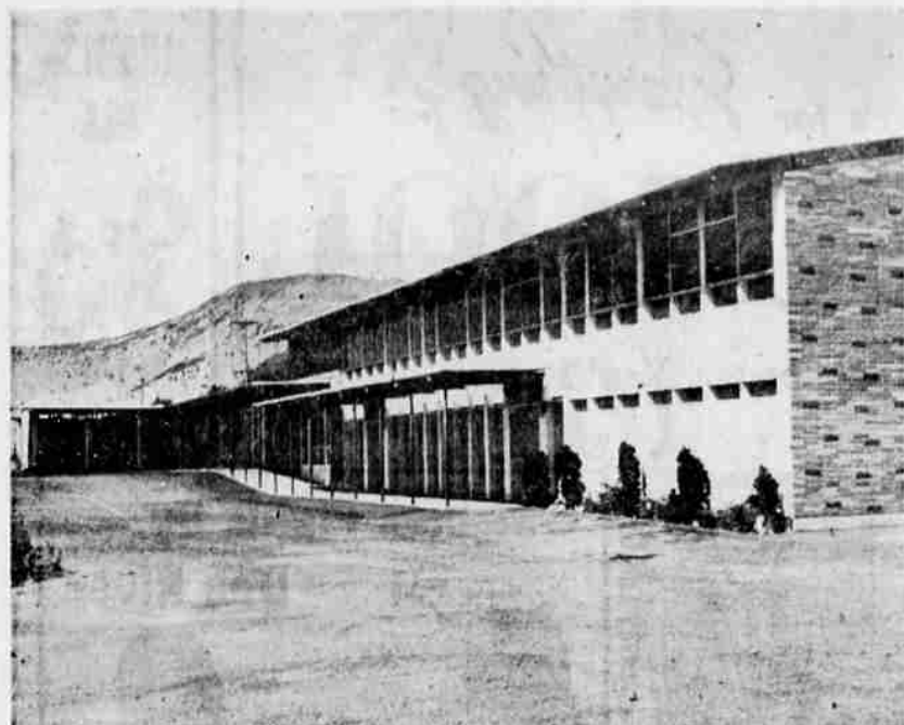
AN EXAMPLE of modern day architecture is this view of one of the most recent additions to the grade schools of the suburban area, named for the late Twyla Ferguson. The school will be looking forward to its third full school year when the county system opens classes on Monday, September 8. Principal is A. C. Olson. Average daily attendance last year 507.