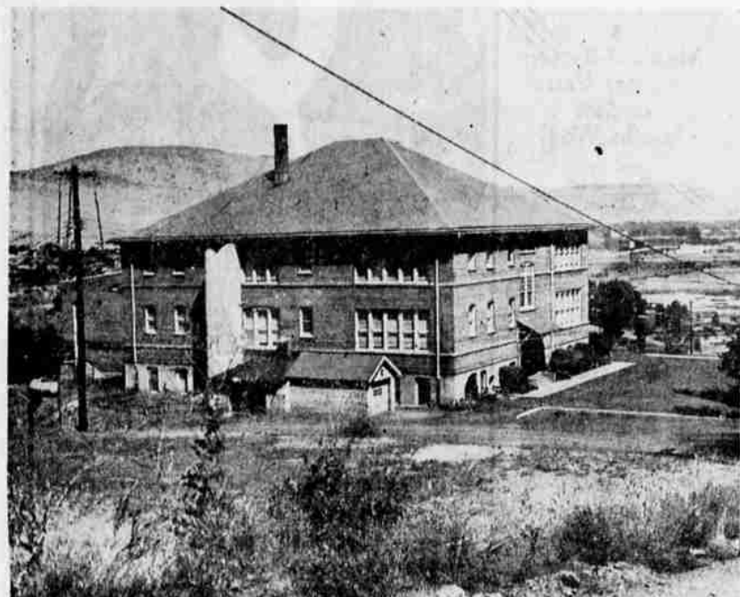
OLDEST OF ALL the grade school buildings is Riverside School, shown here. The building was constructed in 1910, and remains the oldest school building of the area. Enrollment last year was 264 with about the same figure anticipated for the coming school year, commencing September 8.