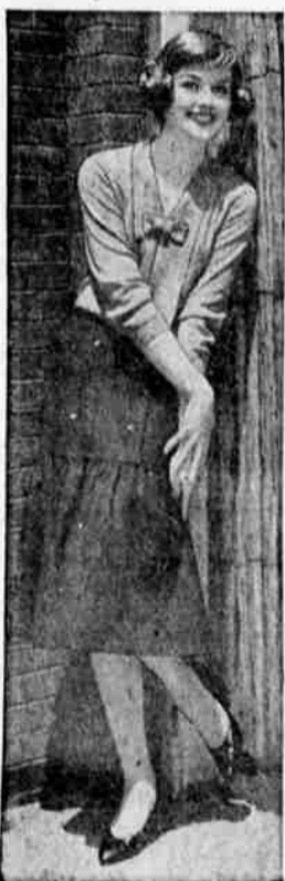
THE TORSO SKIRT —Starred in any school wardrobe will be this slim-torso, wide skirt design with the four buttons that are a smart fashion accent as well as fasteners! All-wool flannel in crayon-bright colors, topped with a smart-as-paint, blouse-styled sweater.

Chewing gum and adhesive tape: sponge the mark with spot remover, then launder according to fabric requirements.