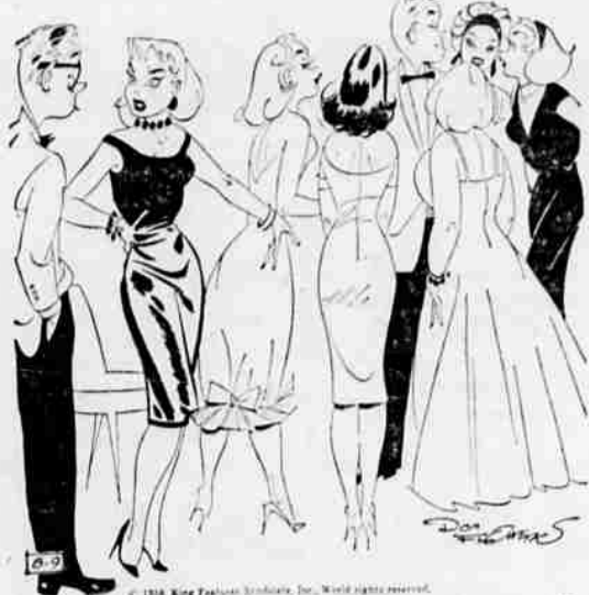
"I thought you told me he was a MAN'S man!"