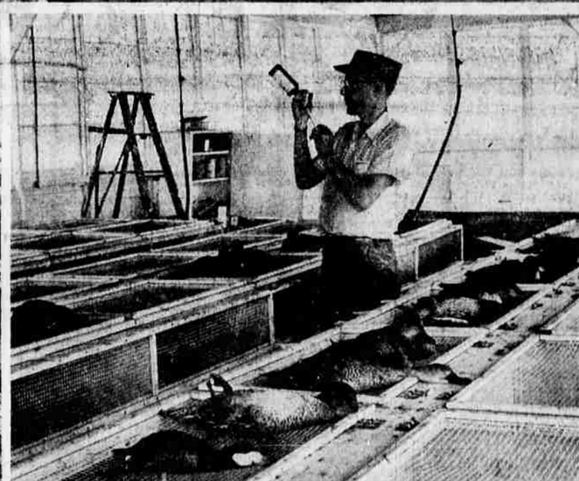
BOTULISM, DREAD DISEASE OF DUCKS in the hot weather seasons, has been marked in the Klamath and Tulelake basins during the last seige of hot weather, according to recent reports. While not yet of the magnitude of past outbreaks, all personnel are keeping a sharp eye out for all possible control measures in an attempt to lick the outbreak before the northern flights arrive in the area. Crews are working now, picking up the sick ducks (botulism is found on exposed mud banks as the water levels recede, thus allowing fertile conditions) and treating them at the Tulelake station. The top picture here shows the laboratory in the background and