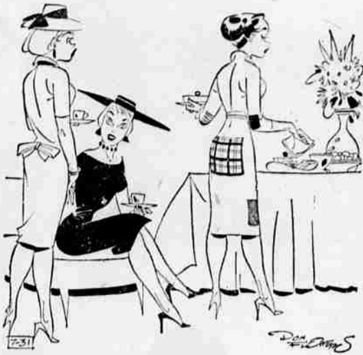
"She REALLY dresses to please her husband."