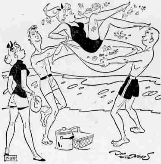
© 1958, King Features Syndicate, Inc. World rights reserved. "That's no way to toss a salad!"