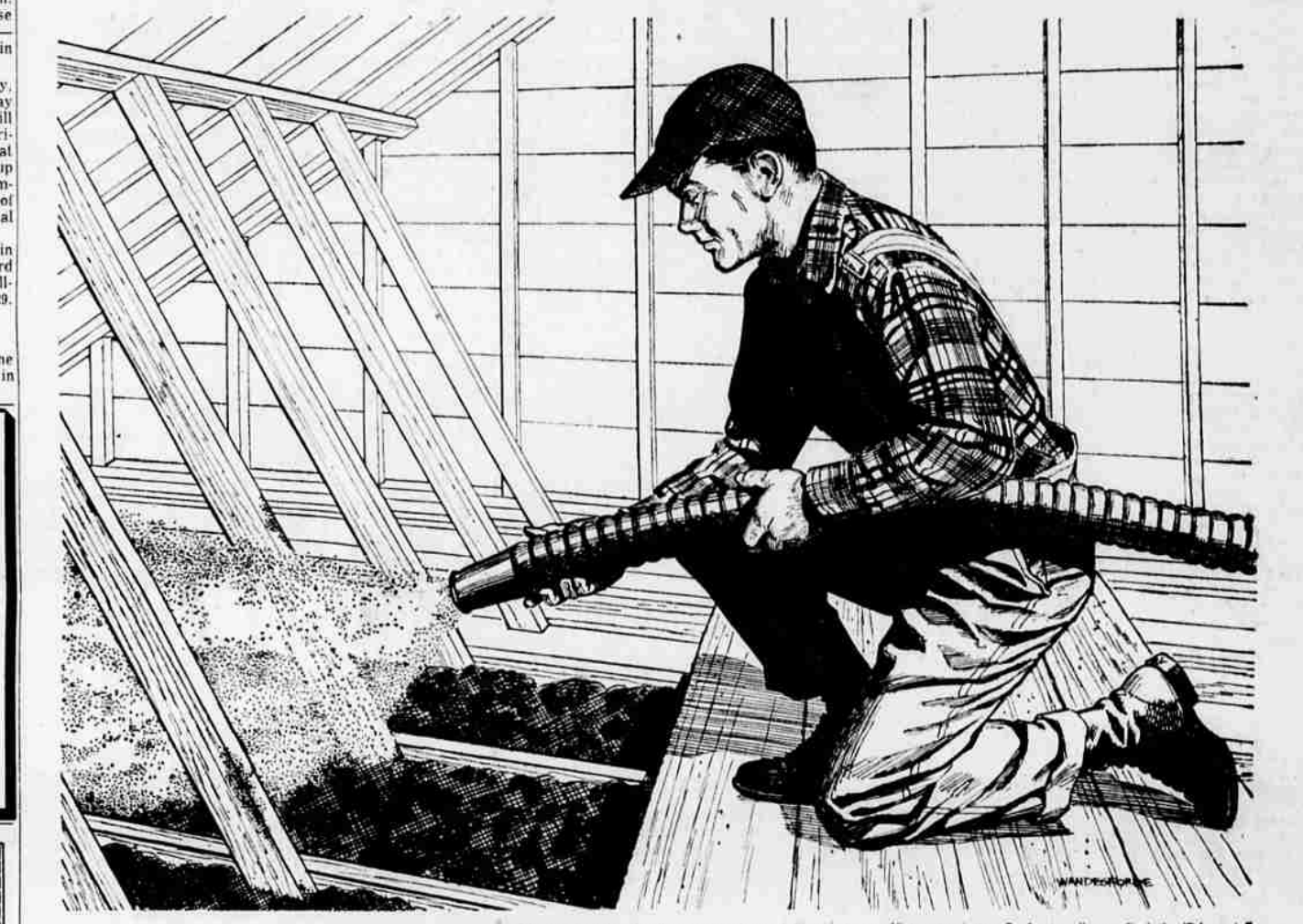
Silvawool - scientifically processed wood fibers - is an efficient insulation. Professionally applied, the "blow-in" method fills every corner and crevice, forming the insulation into a fluffy mat that locks out heat or cold.