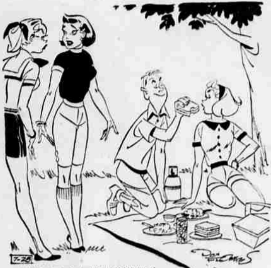
"What can I do? He brought his own lunch!"