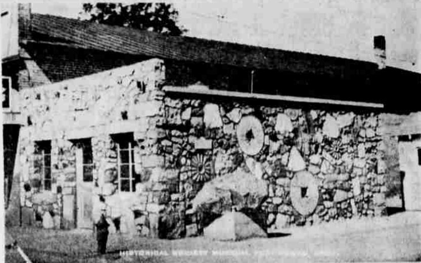
FT. JONES MUSEUM