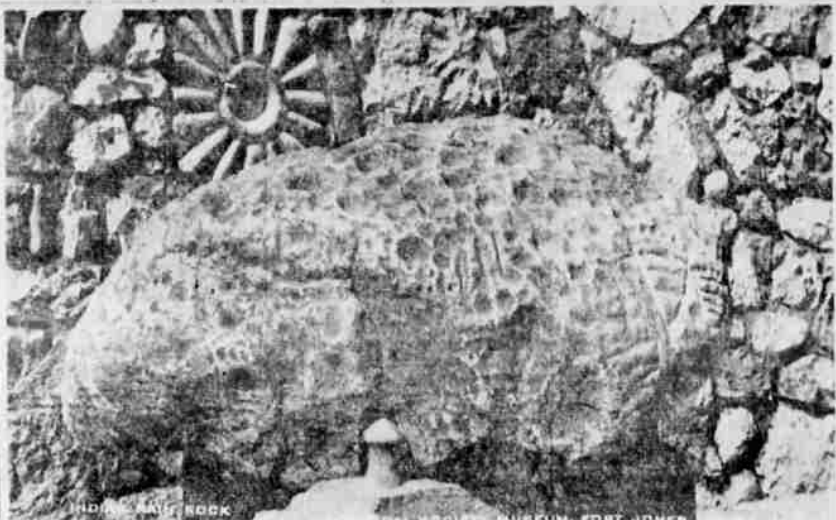
LEGENDARY INDIAN RAIN ROCK

Sales of series E and H Savings Bond purchases for the first half of 1958 were up seven per cent