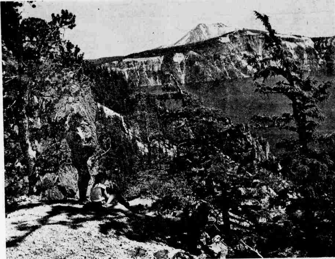
MOUNT SCOTT LOOMS UP in bulky majesty across the blue waters of Crater Lake for the benefit of these two tourists. The scene is only one of many of spectacular beauty to be found around the rim of the world's bluest lake.