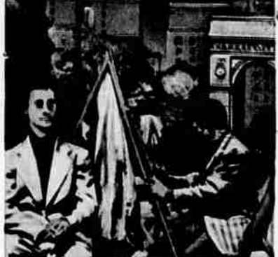
ART GALLERY—"PICNIC" STYLE! Each Spring and Fail, the artists of Greenwich Willage encircle Washington Square with a colorful outdoor showing of paintings, sculpture and craft-works. There's so much to see in New York—museums, concerts, movie premieres, Broadway "first nights"—and the RNOW YOUR AMERICA PROGRAM shows you all of them.

Now You and Your Family Can Visit Every Glorious State with these New Educational Album Guides to America!