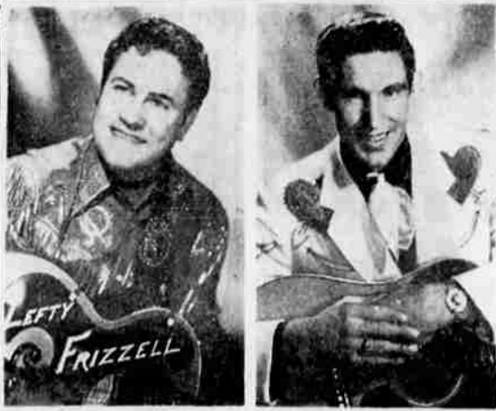
LEFTY FRIZZELL FREDDIE HART