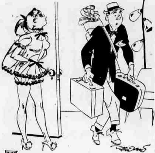
"Planning separate vacations this year?"